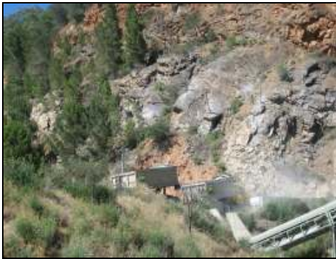
Figure 2. Trucks in the conveyor feed bin area

The 90m high quarry slope had no vehicular access to the proposed crestline work area making it impossible to use cranes. This dictated that all personnel, materials and installation equipment had to be lowered onto the slope using roped access methods. Further site restrictions concerned operational safety in the conveyor feed bin area. For commercial reasons, the plant had to continue normal daytime operations and for safety reasons the contractor was restricted from working during these times (Figure 2).