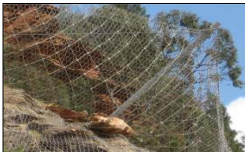
Figure 15. Rock detachment caught by catch fence

Rockfall protection and mitigation systems are vital in maintaining the safety and operational continuity of mining infrastructure networks and installations. Over recent years, extensive investment in research and development has yielded many new innovative rockfall products, such as those used on these projects, for the mining industry. The installation of the high specification catch fence at Boral Quarry was completed within the timeframe initially conveyed to the client. Lightweight fence components and a practical installation methodology made for a safe working environment where no disruption was caused to quarry working procedures. Since the fence was installed, a number of rock detachments have been successfully stopped by the fence thereby ensuring the safety of personnel and the operational capacity of mining equipment (Figure 15).