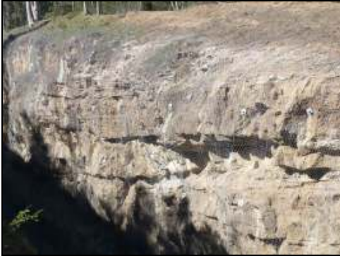
Figure 11. Anchor pattern and the mesh

The top anchor calculation takes into account the weight of the mesh as well as the calculated stress within the draped mesh of 50 KN/m. Cement grouted galvanized steel anchors were installed along the crest of the slopes, penetrating a minimum of 1m into competent rock. The top anchors were designed to hold the mesh by supporting a continuous galvanized steel rope which ran along the anchors.