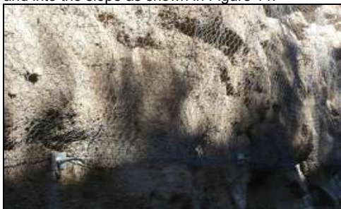
Figure 13. Bottom cable between bottom anchors

installation of steel rock anchors through the mesh and into the slope as shown in Figure 11.