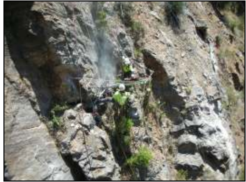
Figure 3. Drilling and installation of fence anchors

The best solution open to the contractor in order to perform the scaling and fence installation works, outside the normal operational hours of the plant, was to use specialised rope access techniques.