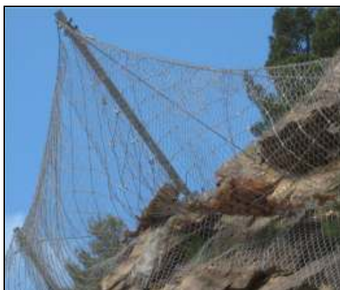
Figure 6. The HEA cable mesh interception structure arresting a number of detachments

The CTR/05/07/B barrier was chosen due to its capacity to be installed on almost any rock/soil type and profile. Optimum system design enabled the anchor pull-out forces to be reduced, resulting in shorter and more cost effective anchorages. The specific barrier layout and versatile components made it ideal for use on rugged slopes where consistent vertical and horizontal alignment was difficult to achieve. The light tubular posts, aluminum energy dissipaters and shorter anchors mean the system was light enough to be installed on the steep slopes with limited access.