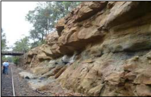
Figure 7. Undercutting of sandstone units

The rail cutting varies between 6m and 13m deep with slope angles ranging between 75° and 80°. The cutting was excavated into the Braxton formation of the Maitland Group. This comprises conglomerate and sandstone interbedded with narrow weakly cemented siltstone horizons. The rock mass is moderately weathered on the exterior faces. The estimated strength of the general rock mass (the dominant sandstones and conglomerates) varies from medium to high strength. The interbedded siltstone horizons are of low strength and are prone to mechanical, chemical and meteorological weathering. Weathering of the less durable siltstone interbedded zones results in undercutting of the more competent overlying sandstone units. This process can form overhangs of up to 1.4m as shown in Figure 7.