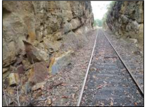
Figure 8. Rock falls near the railway line

A visual site inspection identified several rocks laying within the cess drains adjacent the railway line. In these areas it was deemed that the cut face had been subject to toppling and minor wedge failures resulting from the intersection of joint sets and bedding horizons. The blocks were tabular in form with the largest from 0.4m to 0.6m across as shown in Figure 8. The locations of the fallen blocks were in close proximity to the erosion related to the undercutting of the more competent units. In addition to larger block failures, other less significant instabilities were noted along the line, these were typically related to raveling of smaller blocky debris with individual rock sizes of less than 0.3m.