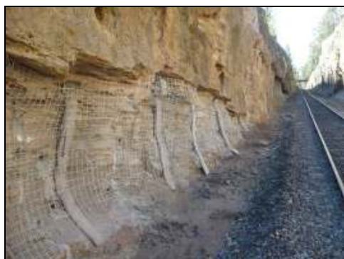
Figure 9. Siltstone before shotcrete application

and below the slope. This would be followed by the selective application of a reinforced shotcrete facing covering only the weaker interbedded siltstone/sandstone horizons (Figure 9) thereby protecting them from further weathering. All other areas of the slopes would be shrouded in a high strength steel geocomposite mesh followed by the installation of tensioned rock anchors.