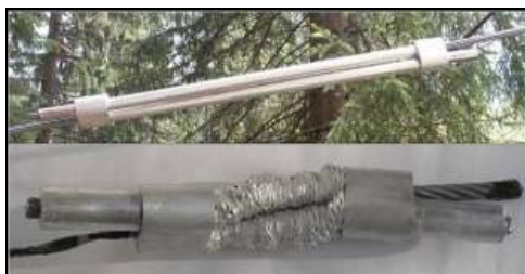
Figure 5. Energy dissipater before (above) and after (below) impact

The system comprises a steel mesh panel interception structure that is placed on the down slope side of the barrier posts. The steel posts act independently of the mesh and if a post is impacted by a falling block and damaged, the adjacent posts absorb the additional forces thereby ensuring that the energy dissipation performance of the system is not compromised. The energy dissipaters absorb the applied energy by deformation - not by friction (Figure 5), thereby guaranteeing reliable performance. The rockfall barrier meets quality certification standard UNI EN ISO 9001, at each step of design, manufacturing and marketing. During the crash test, the forces acting on foundations were measured with load cells. The deflection and geometric parameters were measured at the moment of maximum elongation and in the residual condition in accordance with the relevant guidelines.