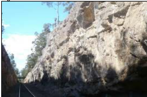
Figure 14. Completed Steelgrid MO installation

The complete installation of 1740m 2 of Steelgrid MO, 180 No. 4m long anchors, 150 No. top and 2m long bottom anchors took 15 days to complete. A photograph of the completed project is shown in Figure 14.