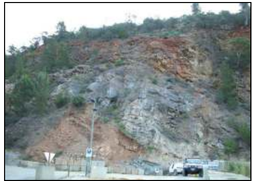
Figure 1. 90m high rock face

ranging from 42° to 70°. The shallower angles have arisen from a combination of undercutting of the toe and associated localised slipping of material. All batters have highly irregular profiles and contain a larger number of loose and overhanging rocks.