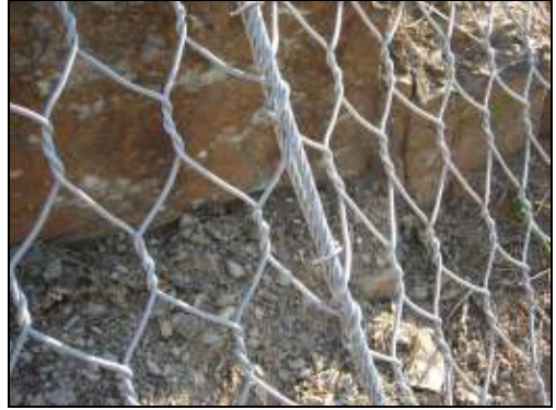
Figure 12. Galvanized steel cables interwoven with double twist mesh within the Steelgrid MO

Steelgrid MO is a composite product featuring interwoven double twist steel wire mesh with high tensile steel wire ropes. These ropes are 8mm in diameter and are longitudinally woven into the run of mesh, along each side as well as down the centre.